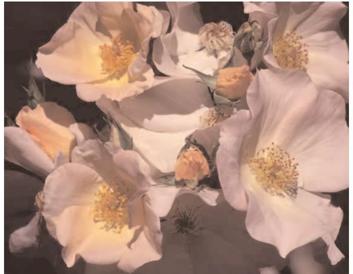
'Sally Holmes'. Shrub. Zones 5 to 10