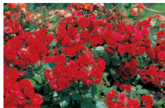
'Daydream'. Shrub. Zones 5 to 10