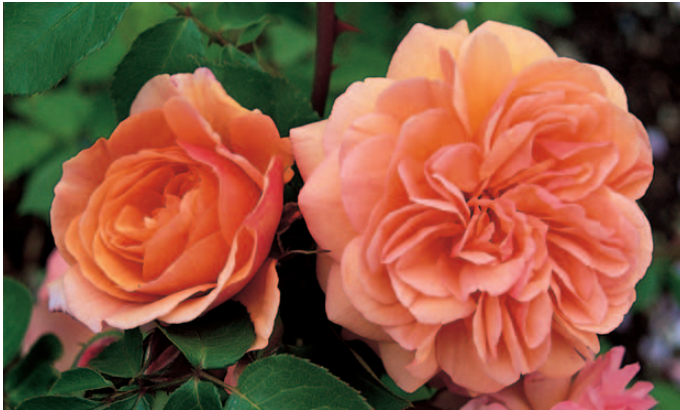
'Louise Clements'. Shrub. Zones 5 to 10