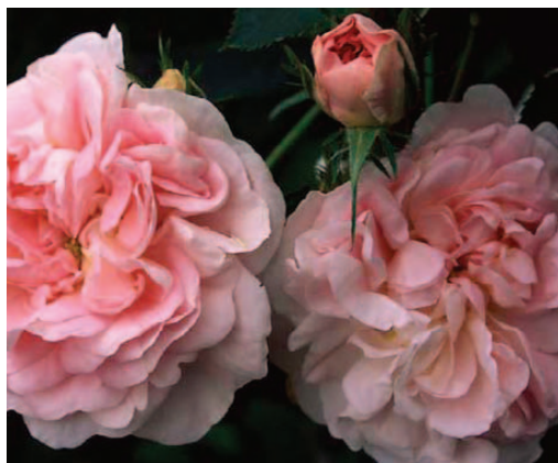
'Maiden's Blush'. Alba. Zones 4 to 9