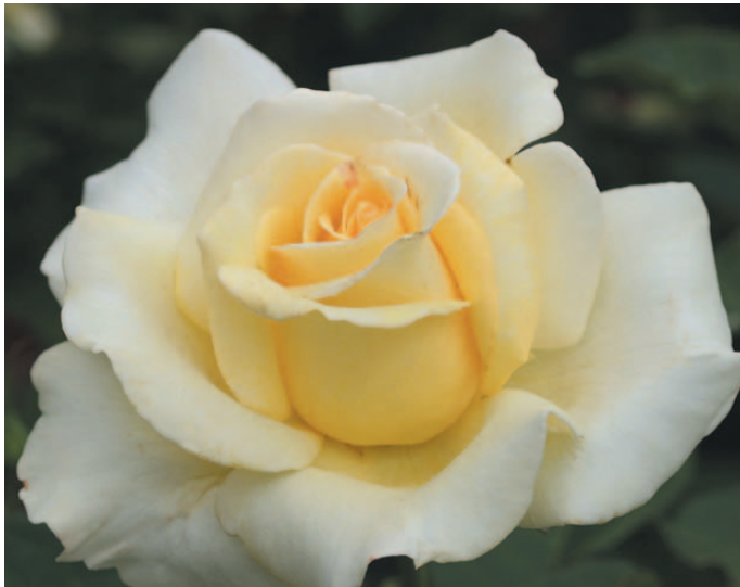
'Elina'. Hybrid tea. Zones 5 to 10