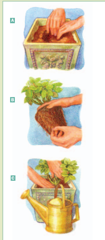
—illustrated by Renée Quintal Daily