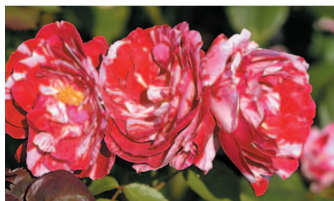
'Sentimental'. Floribunda. Zones 5 to 10