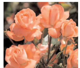
'Ainsley Dickson'. Floribunda. Zones 5 to 10