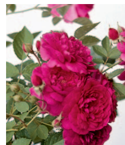
'Sweet Chariot'. Miniature. Zones 5 to 10