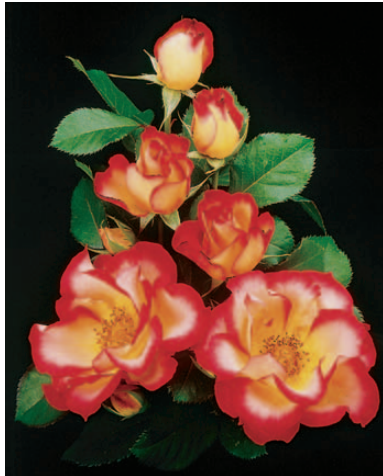
'Betty Boop'. Floribunda. Zones 5 to 10

thanks to all those nurseries who have loaned us their rose photos so that we can share their beauty with our readers. These companies, among others, also sell these plants either on-line or through their mail-order catalog. (See page 14 for a list of mail-order resources.)