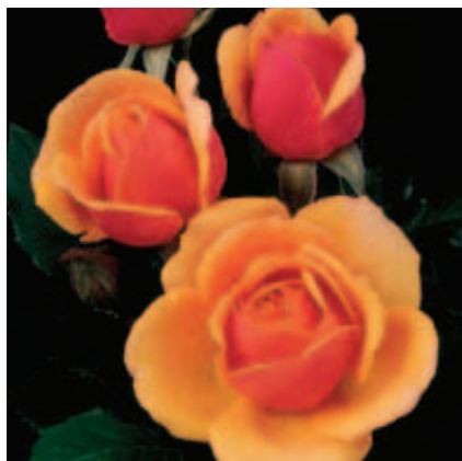
'About Face'. Grandiflora. Zones 5 to 10