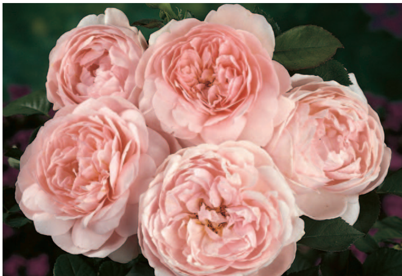
'Ambridge Rose'. Shrub. Zones 5 to 10