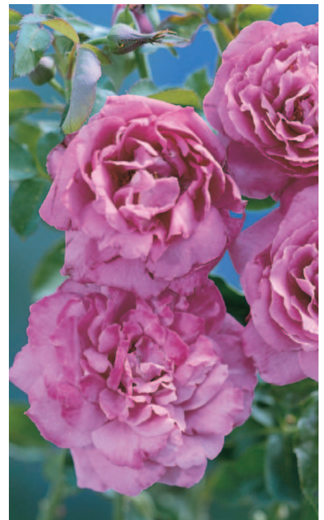
'Royal Amethyst'. Hybrid tea. Zones 4 to 10