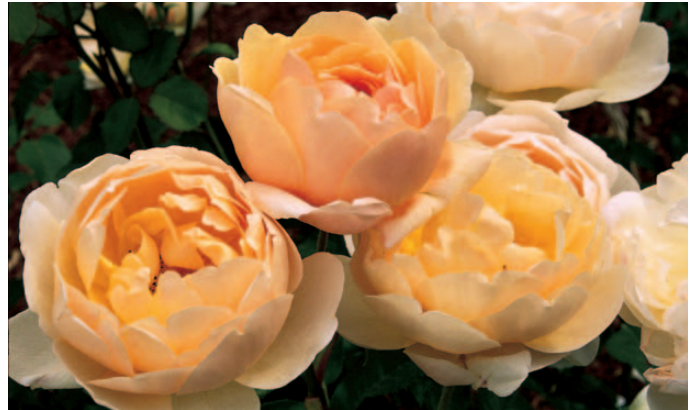
'Jude the Obscure'. Shrub. Zones 4 to 10