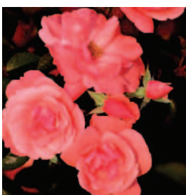
'Lady Elsie May'. Shrub. Zones 5 to 10