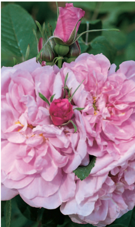
'Thérèse Bugnet'. Hybrid rugosa. Zones 2 to 8