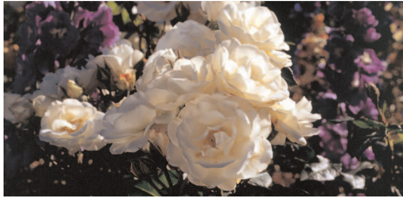
'Fragrant Wave'. Floribunda. Zones 5 to 10