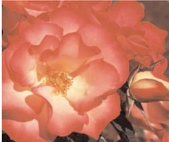
'Birthday Girl'. Shrub. Zones 5 to 10