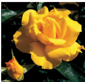
'Midas Touch'. Hybrid tea. Zones 5 to 10