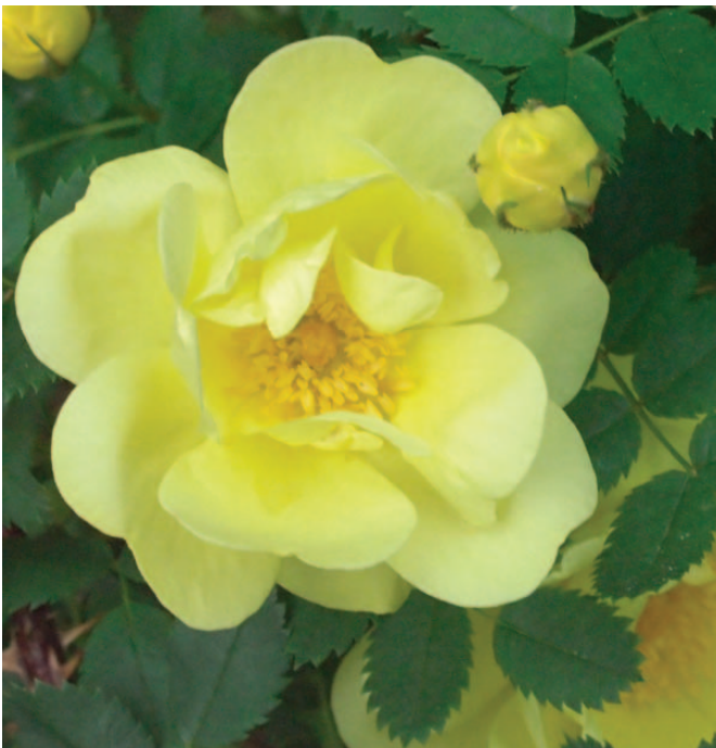
—Kent Kruegh, woodlandrosesgardens.com

■ YELLOW ROSES. 'Harison's Yellow' ( below , Zones 4 to 9), also called 'Pioneer Rose', blooms early, brightly, and sweetly and will survive Zone 4 winters.