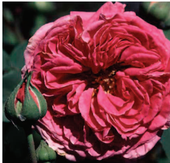
'Mme. Isaac Pereire'. Bourbon. Zones 5 to 10