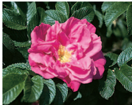
'Apart'. Rugosa. Zones 2 to 8