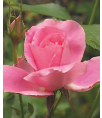
'Carefree Beauty'. Shrub. Zones 4 to 10