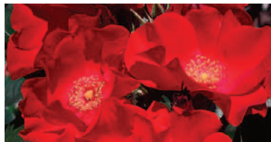
'Robusta'. Shrub. Zones 3 to 9