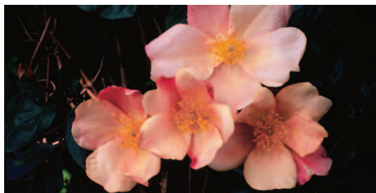
'Mutabilis'. Hybrid China. Zones 7 to 10