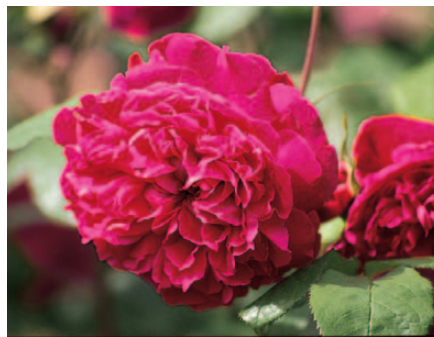
'William Shakespeare'. Shrub. Zones 4 to 10