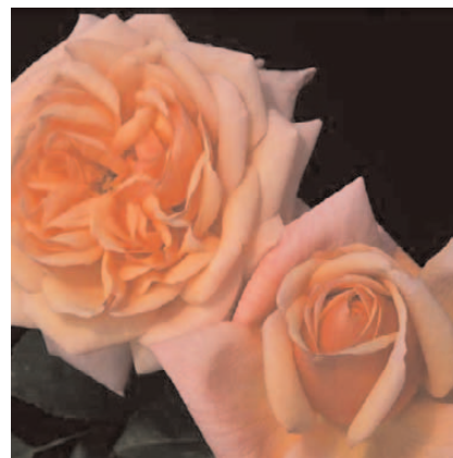
'Dixieland Linda'. Climbing shrub. Zones 5 to 10